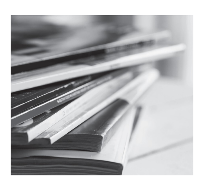
22 Regulation (EU) No 1025/2012 on European standardisation

In standardisation a technical specification means a document that prescribes technical requirements to be fulfilled by a product, process, service or system and which lays down the characteristics required of a product or a service, production methods and processes or the methods and the criteria for assessing the performance of construction products<sup>22</sup>.